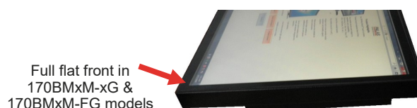
Full flat front in 170BMxM-xG & 170BMxM-FG models